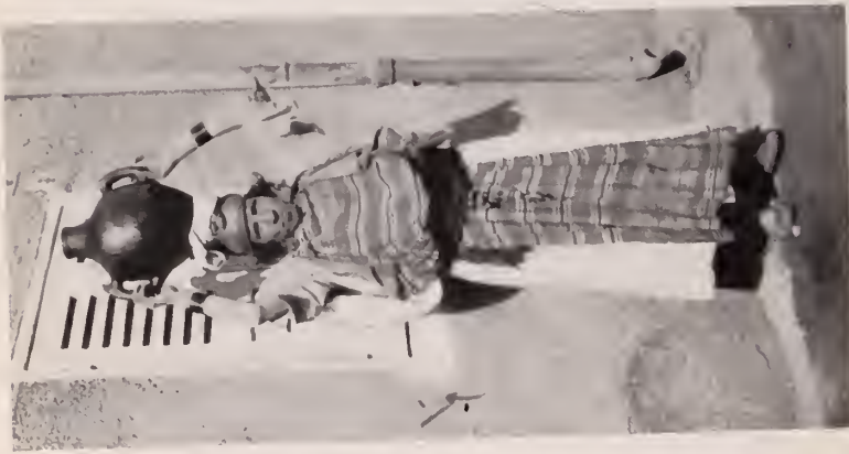
A Kabyle woman carrying a water-jar on her head